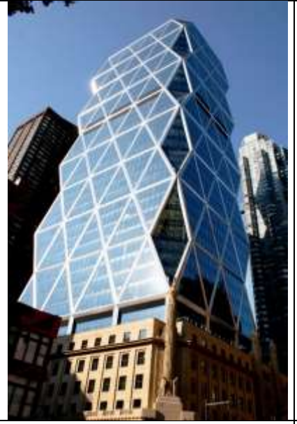
the Hearst building in the United States of America...