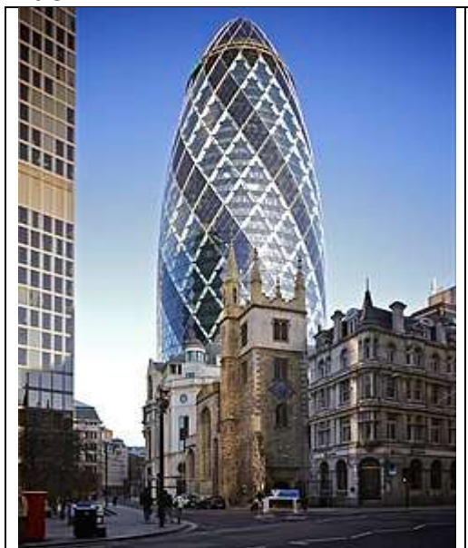
the Seuss Ray building in London