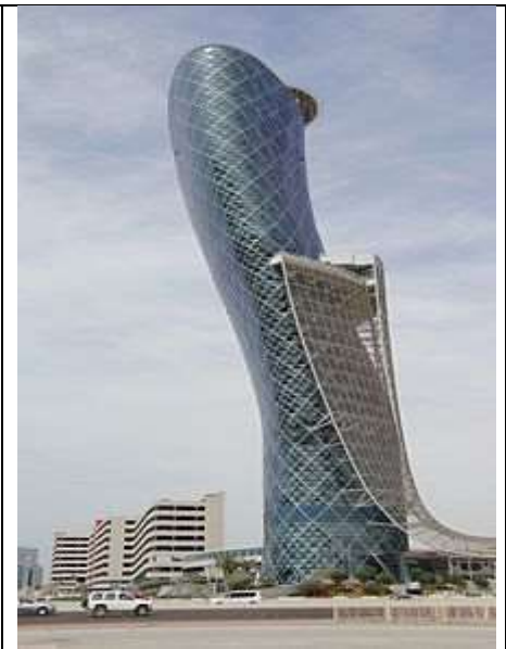
The Capital Gate Tower