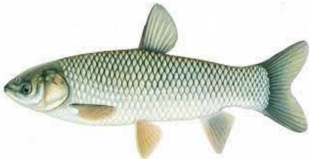
Figure 2. Amur Cup

Crayfish - This fish feeds on zooplankton organisms that occur naturally in ponds. Because these fish are intensively or polythene-fed, their numbers in the pond are very high. Therefore, these fish are fed by artificially prepared mixed feed. Currently, in Uzbekistan, for intensive feeding of this fish, various compound feeds are imported from other countries. The fat content of fish is very high due to the high content of various vitamins and proteins in the feed. The grass carp is a reed, a lux that grows naturally in ponds (Figure 2). Reeds and lux contain almost no protein and more fiber. Therefore, it is now a tradition in the Republic to feed this fish with alfalfa in intensive feeding. if not discarded, it will reduce the amount of oxygen in the water.