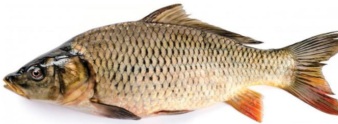
Figure 1. Cranberry

At present, three types of fish are intensively fed in the country. These are the carp, the white amur, and the white-tailed deer (Figure 1).