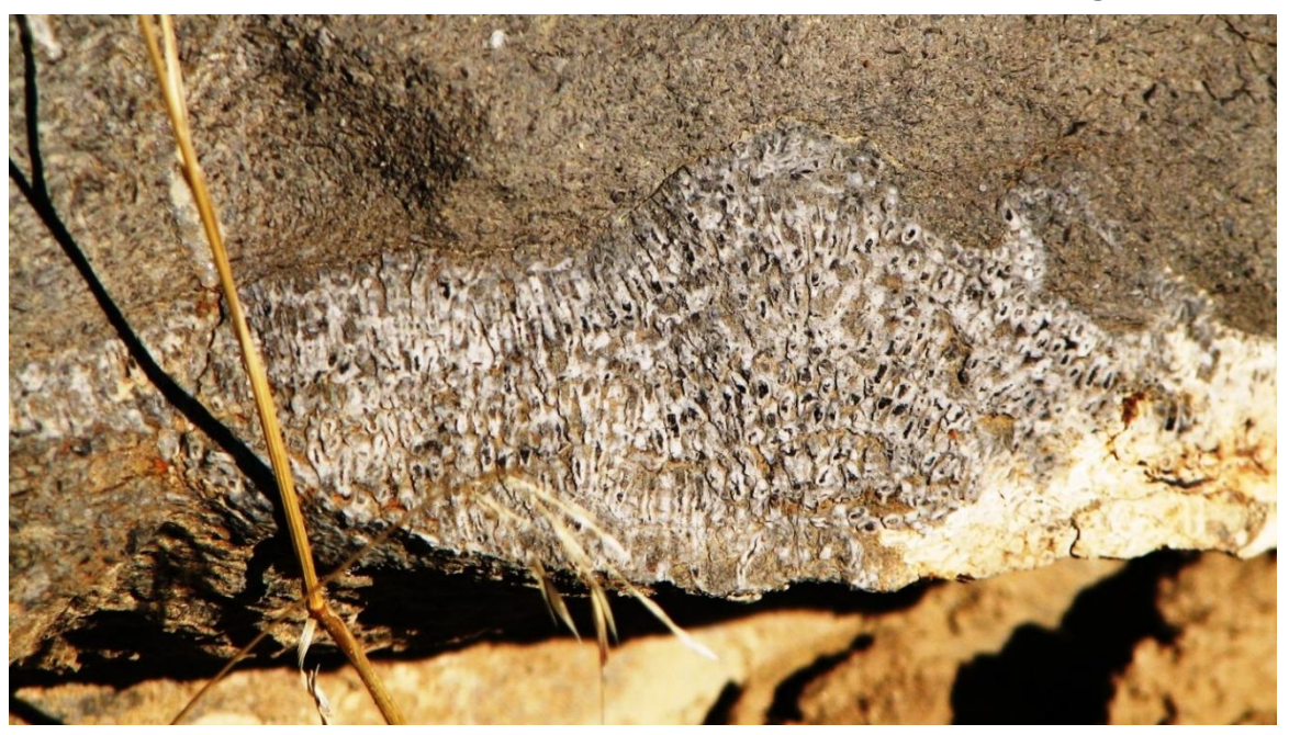
Fig.2. Fragment of an upturned epitheca of a coral colony in a Paleoaplysin bioherm edifice, Takhtatau Mountains

and Timan, which he assigned to the order