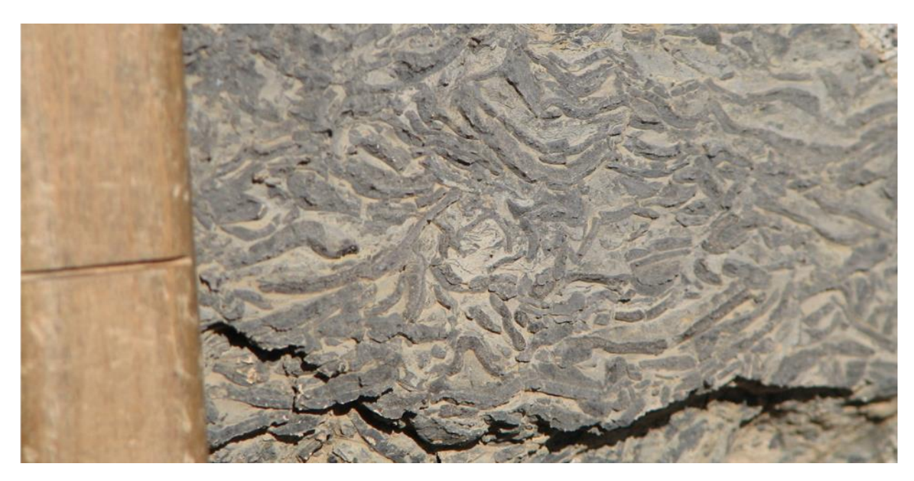
Fig.4. Fragment of a colony of Palaeoaplysina bossaica Smirn., sp. nov. in reef deposits of the Upper Takhtatau Subformation of the Takhtatau Mountains

and their wide geographical distribution is being established