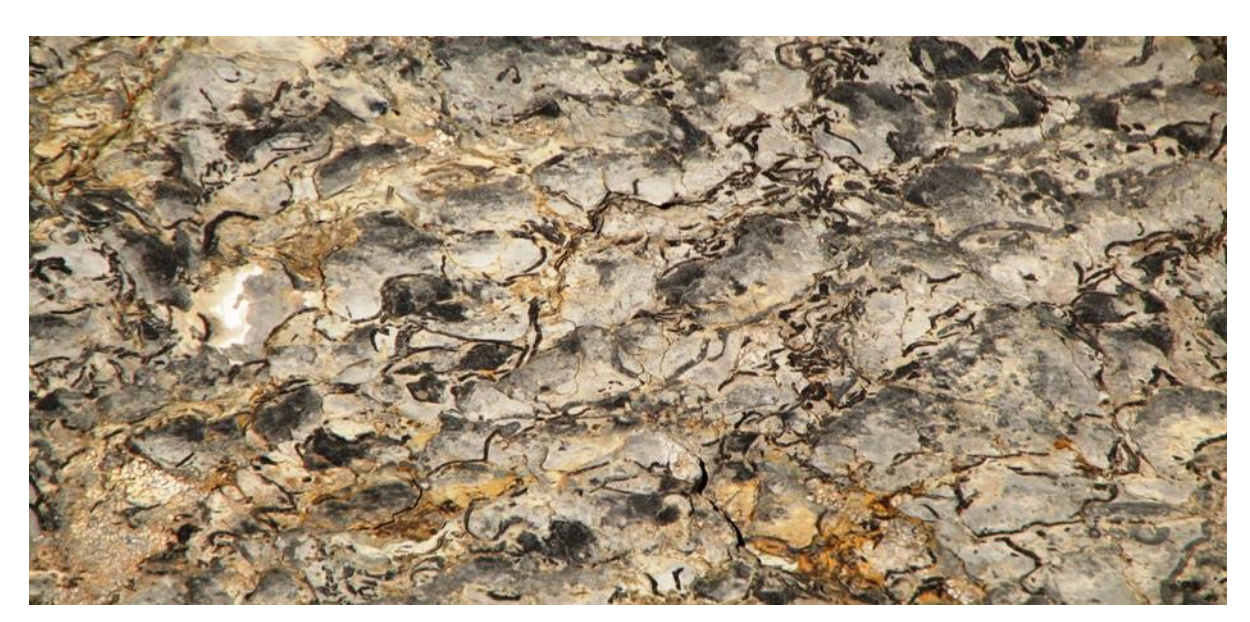
Fig.3. Fragment of a colony of Palaeoaplysina bucanti Smirn., sp. nov. in reef deposits of the Upper Takhtatau Subformation of the Takhtatau Mountains.

Tubulariae of the class Hydrozoa. Much later, Ryabinin (1955) summarized all the available information regarding the named organisms concluded that all three genera Uralotimania and Palaeoaplysina are the same organism, which, by right of priority, should be retained the name Palaeoaplysina [3].