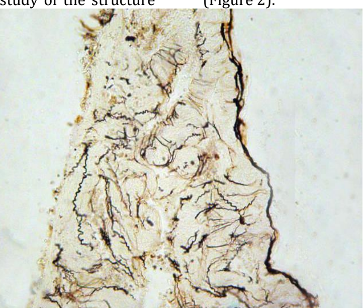
Fig. 2. Reticular fibers lateral endocardial wall of the left ventricle 6 days of age in the control group. Staining: Impregnated with silver nitrate by Foote in Yurina modification. Magnification: oc10, ob20

Ventricular endocardium comprises a longitudinally directed bundles of collagen fibers. Identify areas where longitudinal occurring bundles of collagen fibers are intertwined with each other. The fiber bundles of connective tissue located closer to the myocardium of the ventricles are interwoven with bundles of connective tissue fibers located between the beams of cardiomyocytes inner laver of the myocardium. The thickness of the bundles of collagen fibers endocardial ventricular ranges from 5,7mkm to 11,4 microns. Beams ventricular endocardial elastic fibers lie loosely compared with bundles of collagen fibers. In bundles of fibers adjacent to the ventricular myocardium increased packing density. The thickness of the elastic beams ventricular fibers ranges from 5,7 to 9,5 microns. Reticular fibers ventricular endocardium located close to each other (Figure 2).