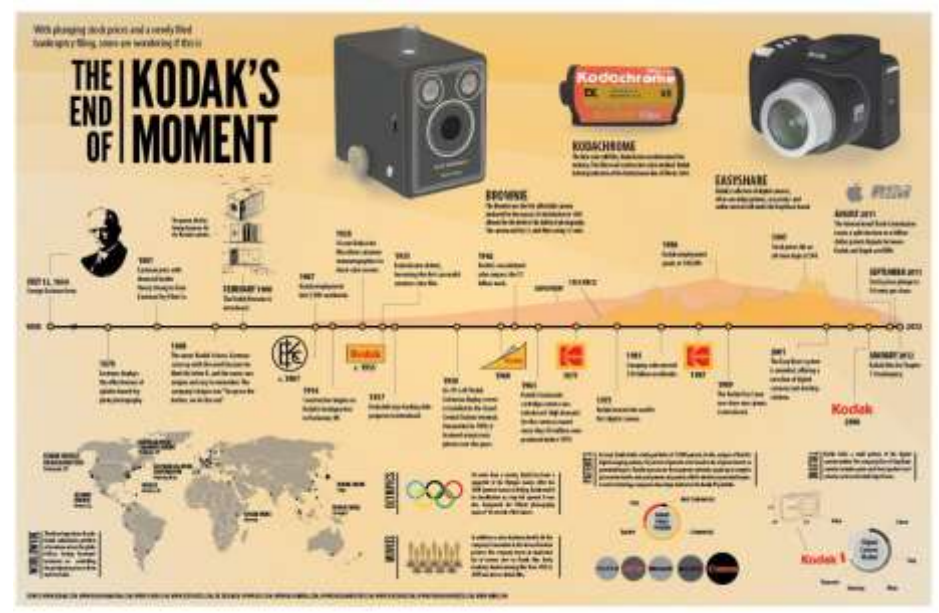
The infographic above shows the history of Kodak

Comparative infographic. A comparative infographic is designed to compare two or more things, approaches, ideas, or events. Such infographics often use a vertical shape to visually show the relationship between opposing elements.