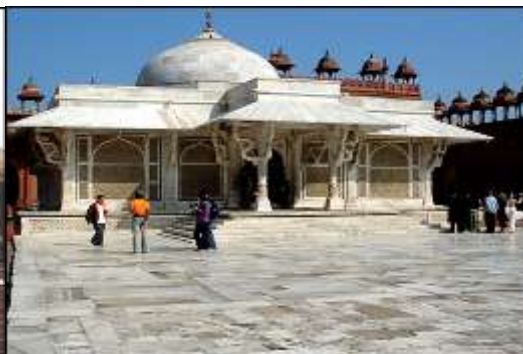
Fig. 10. Tomb of Akbarshah