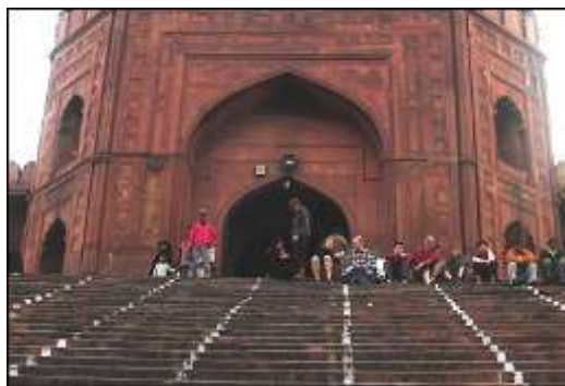
Fig. 9. Founded by Shah Jahan in Delhi Stairs leading to Jome Mosque.

"Khiron-minor" built during the reign of Jahangir, Jahangir's mausoleum, Shahjahan Mosque built during the reign of Shahjahan, and Shalimar gardens are rare masterpieces of world architecture. Shalimar Gardens were included in the UNESCO list in 1981