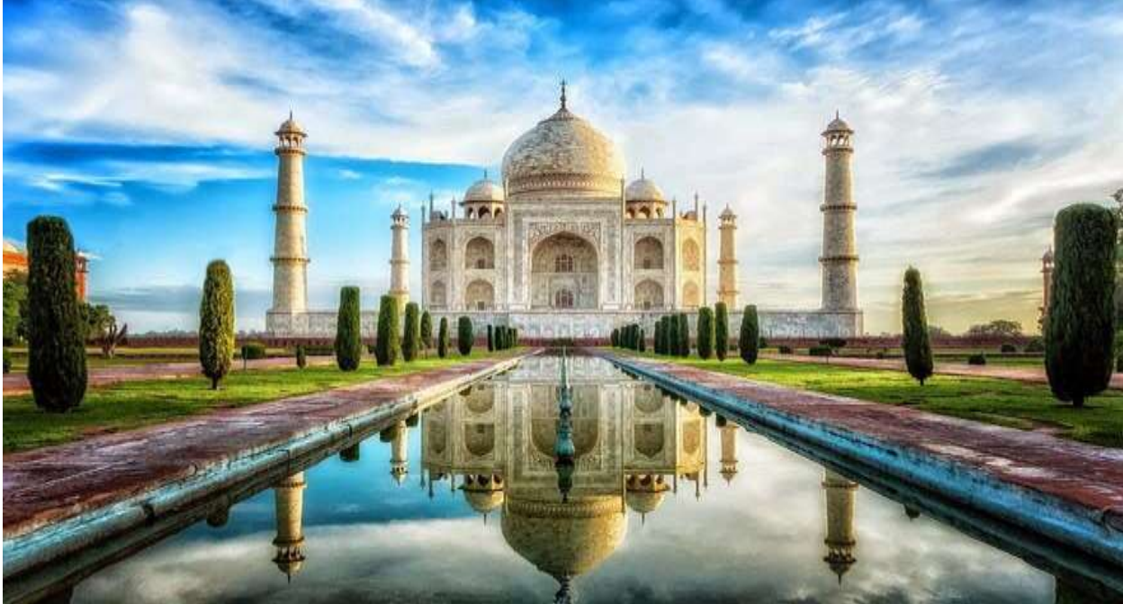
Figure 8. Agra. Taj mahal

The building shines silver in the morning. When the sun is setting, it takes on a golden color. Therefore, guides recommend tourists to visit the mausoleum in the morning or evening.