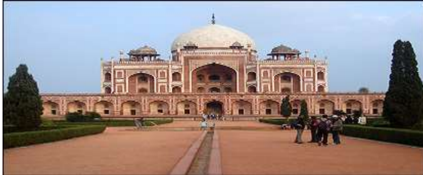
Figure 7. Delhi. Humayun's mausoleum

particular, such complexes as Humayun's mausoleum in Delhi, "Red Fort", "Old Fort", "Taj Mahal" in Agra and Akbar Shah's mausoleum speak about the common history and cultural traditions of India and Uzbekistan.