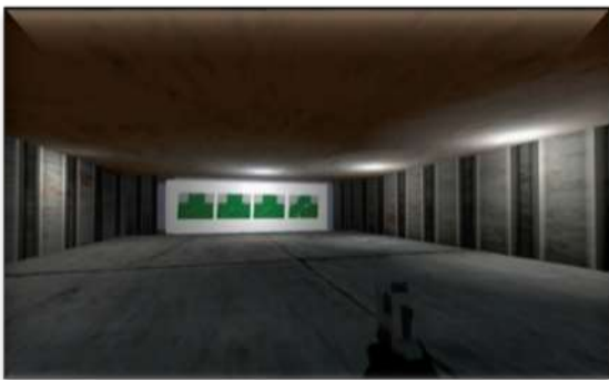
Figure 3. General view of the 25-meter shooting range.

Ventilation of the shooting range during training is considered to be one of the most important aspects, when four or more students shoot at the same time in the range, the