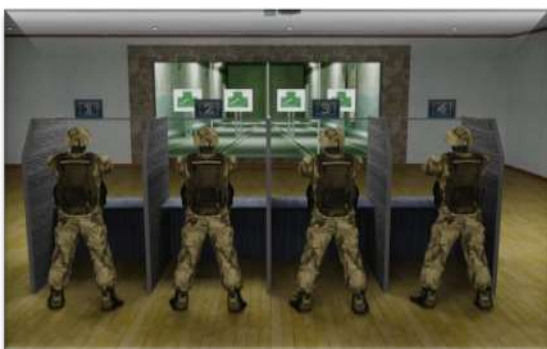
Figure 4. Training process in the 25-meter shooting range.

At first, the cadets move individually and later in small groups (combat twos or threes) or in small groups facing each other and perform both tactical and shooting actions. The cadets use airsoft guns during action to ensure a full feel of the combat situation. As a result, cadets have up to 80% mental endurance and situational awareness during real combat operations.