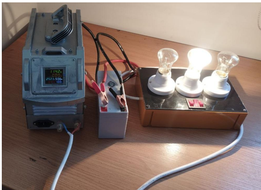
Fig.2. Load characteristic of the inverter

It is established that when the output frequency of the inverter is changed to the minimum and maximum load, the frequency stability changes to \pm 1.2\% (Fig. 2).