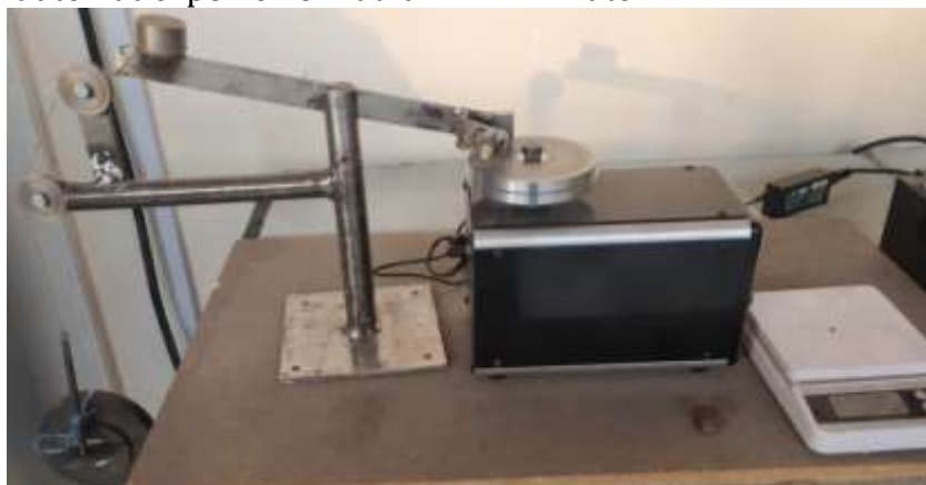
Picture 2. General view of a special device with a diamond disc for determining the wear resistance of samples

selected number of revolutions. It is designed to carry out studies of special grinding disk speeds of 400, 525, 650, 775 and 900 revolutions per minute.